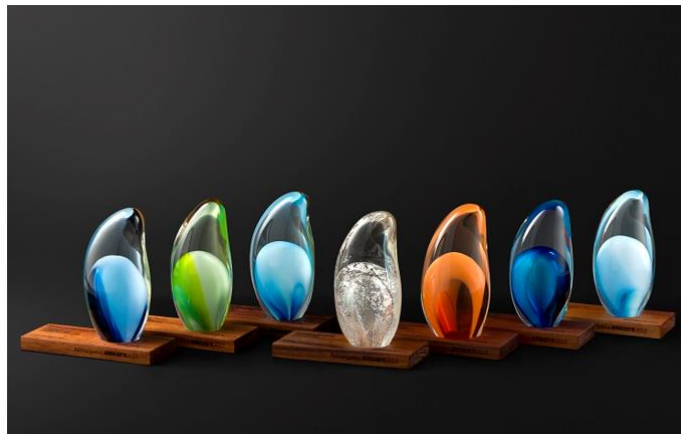
Animal Justice Awards

For the first time, the forum will host the Animal Defenders Expo where animal protection groups can present their information, and network with activists. The Expo is a great opportunity for groups to find new volunteers, and volunteers to find opportunities.